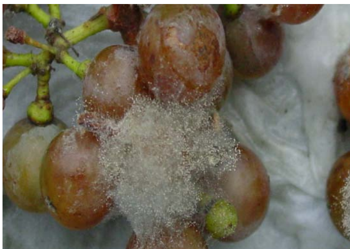
Above: Botrytis cinerea infecting grape berries.

Antagonizer is a naturally occurring fungus Trichoderma harzianum (Td81b) that was isolated from a bunch of grapes in an organic vineyard in Tasmania, (Australia). It was selected for its ability to colonise bunches and act as a natural barrier against Botrytis cinerea (Bunch rot) close to harvest.