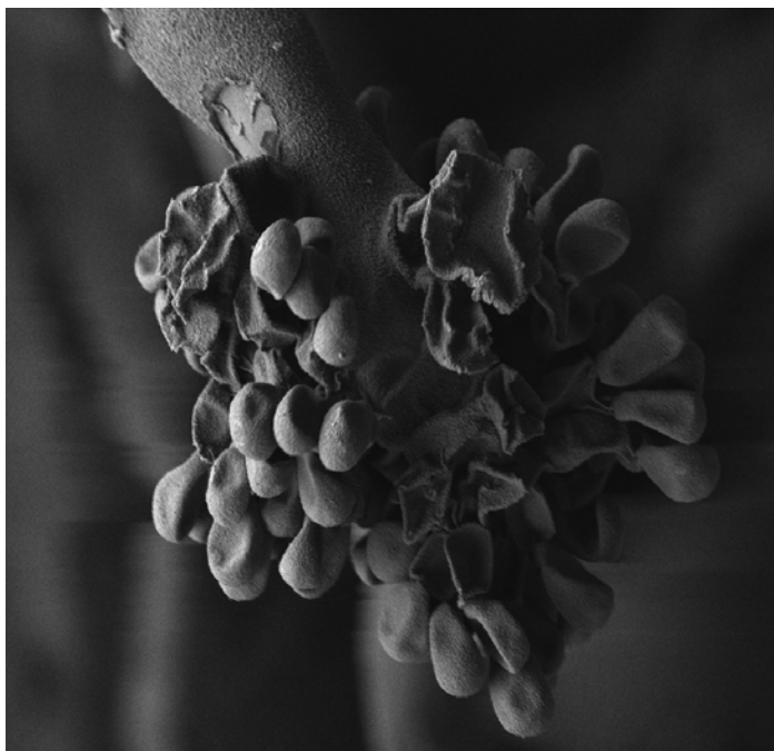
Above: Botrytis cinerea spores erupt from the surface of a berry